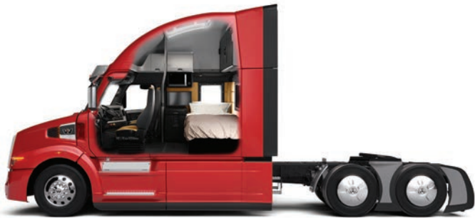
72" Stratosphere High Roof

The ergonomic dash with digital interface features an easy-to-read and customizable layout that gives you the data you need at a glance, with integrated steering wheel controls that let you change vehicle information and entertainment settings without your hands ever leaving the wheel.